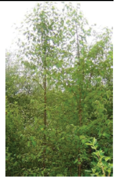
Plagianthus regius.