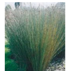
Apodasmia similis.