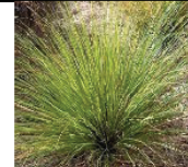
Carex virgata.